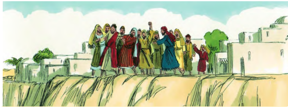
4th Sunday in Ordinary Time—Year C The people in Jesus' hometown of Nazareth reject Him, and they attempt to hurl Him off a cliff (Luke 4:21–30).

Let us face rejection with prophetic courage and optimism. The story of Jesus' rejection in His own hometown is a story that we can identify with, because it is a story that has happened to most of us. Perhaps we have experienced the pain of rejection, betrayal, abandonment, violated trust, neglect, or abuse. What about rejection by those closest to us?