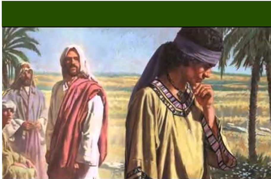
28th Sunday in Ordinary Time

In contrast, the Apostles, who admittedly had less to give up than the rich young man, were more easily willing to give up all they had to follow Jesus. Yet, they also took a risk—giving up their trades and a way of life that they knew and that had become comfortable for them—in order to follow Jesus. Like the rich young man, they were drawn to Jesus, but unlike him, they were able to give up their families to follow Jesus.